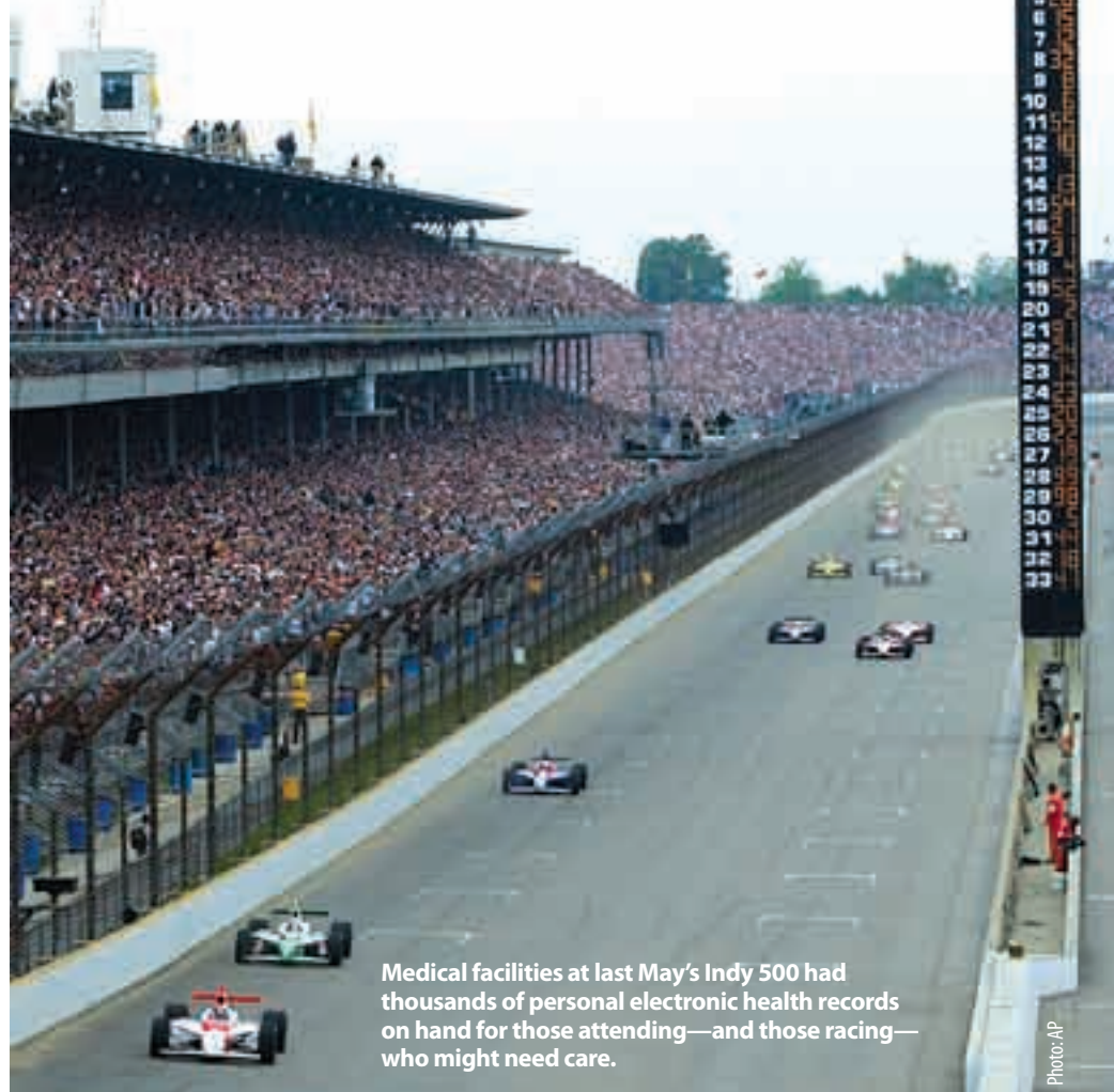
Medical facilities at last May's Indy 500 had thousands of personal electronic health records on hand for those attending—and those racing—who might need care.

INPC is an electronic data-sharing system that allows physicians and emergency medical personnel access to individual patient records. It is made up of 15 hospitals, including all five major hospitals in the city of Indianapolis, and more than 100 clinics. Currently, it provides access to about 1.5 billion pieces of secure health data for most of the residents of the state of Indiana. The